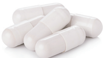
Each vegan capsule is allergen and dye free.

Adult dose is 3 capsules daily or as directed by physician.